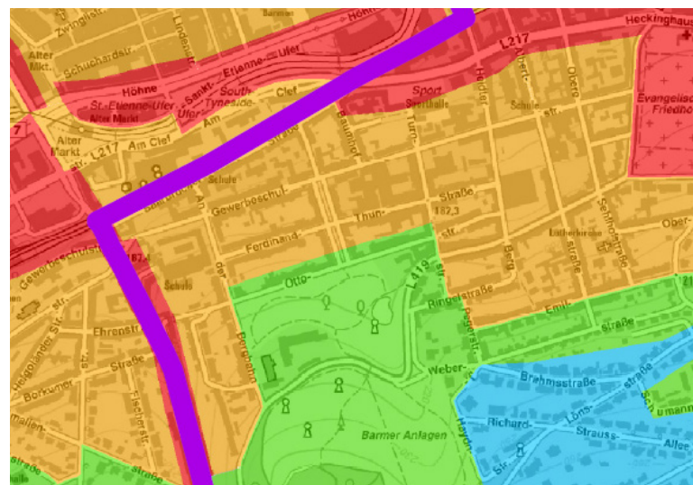
Detail of the housing map Wuppertal-Barmen

Rounding off areas are property parts that cannot be built on independently. They extend the possibilities of use of an existing property and are therefore only of interest to a limited group of buyers. In the case of areas that allow a higher or better structural use on the main property, an average of 90% of the respective standard land value was paid. In the case of areas at the back of the property (e.g. garden land), the average was 20%.